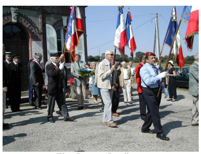
Flag Bearers Leading

Then all officials gathered outside the Town Hall, and following behind the flag bearers proceeded to the church, in which the citizens of the village and surrounding areas had taken their seats.