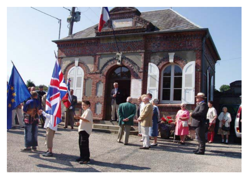
Gathering at the Town Hall - General Coignard at the Entrance