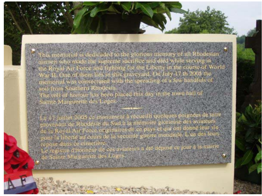
Main Plinth Inscription

Bill Musgrave, veteran Spitfire Pilot from 237 Squadron then placed several handfuls of soil brought from Matabeleland in a hole at the base of the plinth, which was then sealed with concrete.