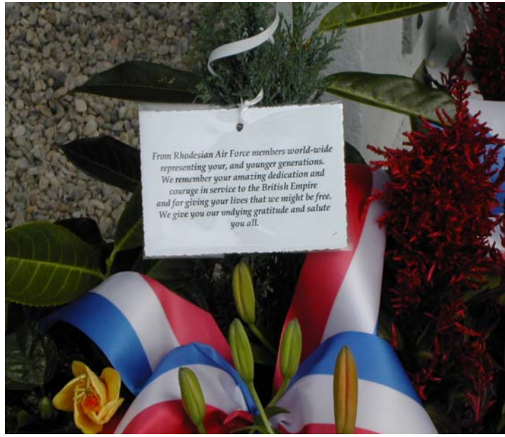
Floral Tributes AFA Tribute

After the service, everyone moved over to the old "lavoire" (outdoor laundry which is a pool with a shed) for a vin d'honneur and then, still in brilliant sunshine, to the marquee in the field above the church, where some 400 hundred people sat down to a 3 hour long four course meal washed down with wine and the local cider. The partying by the younger generation went on till after the fireworks at around midnight.